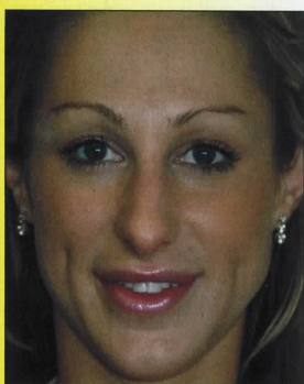
After Ellansé Tx