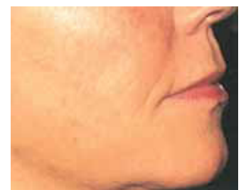
56-year-old woman, before and after four Sculptra treatments